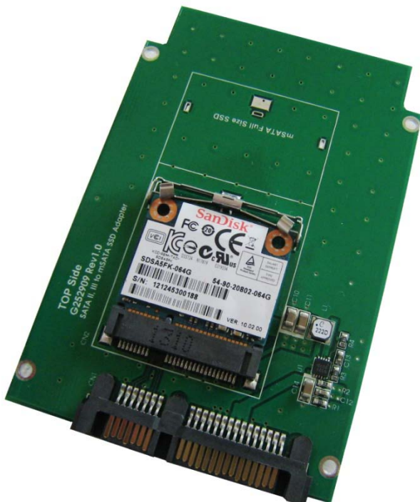
CB963FAH + Half size mSATA SSD

AD963FAH is SATA to mSATA adapter, providing one 7+15pin SATA connector on the host connection and one Mini PCI-e 52-pin connector on the SSD storage devices connections. When assembled, it can operate in a variety of operating systems. Such as DOS, Windows 95, 98, XP, 2000, Vista, Win 7, Linux, Unix, and so on. AD963FAH adapter allows the installation of mSATA SSD as system disk, boot the operating system directly, without having to install any drivers, but does not affect the execution speed of the mSATA SSD.